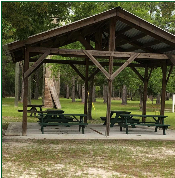
Climbing wall shelter

On July 10th, 2020 the camp will host a group from Jasper, Georgia; First Baptist Church of Jasper. This group has been here on two previous occasions to help the camp with several projects in 2014 and 2016.