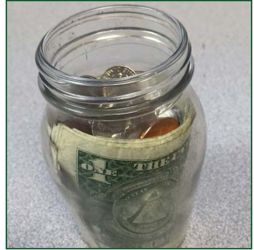
Jar of money

Let me be kind and say $300 plus taxes, parking and hospitality book. Just guessing, but on the low side say there were 300 Lions registered for the State Convention. Quick and simple math, not the new modern method, says that there was 300 X $300 or $90,000 that Lions did not spend. At the same time, your Georgia Lions Camp did not receive any donations from the Silent Auction because it was cancelled. Now you can pay it forward to help your Georgia Lions Camp recoup some of that lost revenue. Pay part of your savings forward. Follow the lead of the jar shown above. Send some of your savings directly to the camp, not through your Lions Club. A gift of $100 would be great and much appreciated and help recoup some of the lost revenue.