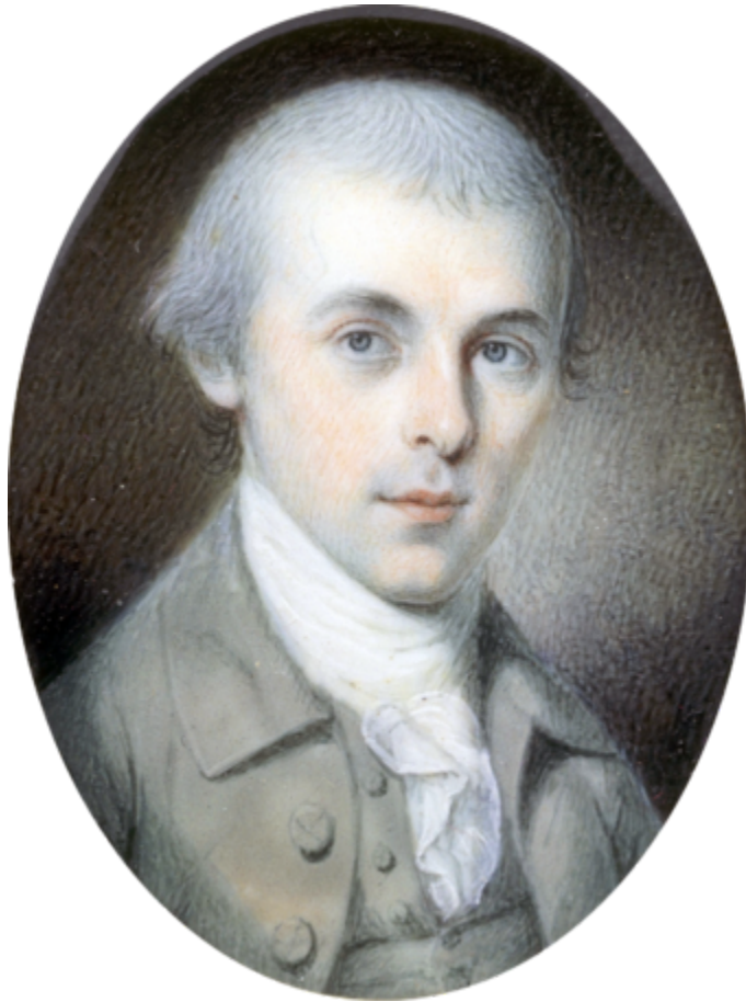
James Madison, age 32 Portrait by Charles Winston Peale