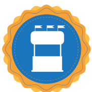
Table Inside (Ballroom) - $3,500