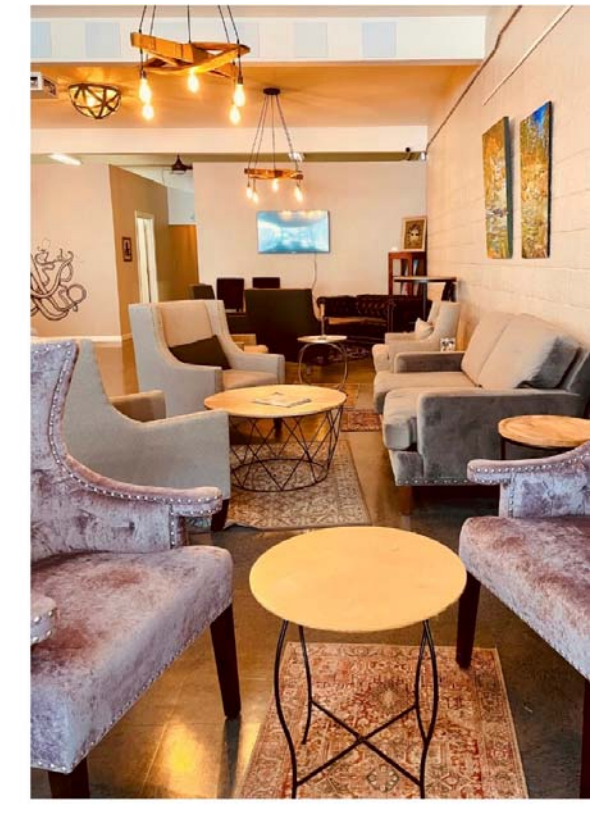
2204 Main St. Susanville