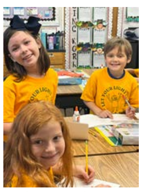
Above: First-grade students write letters to active duty military personnel.