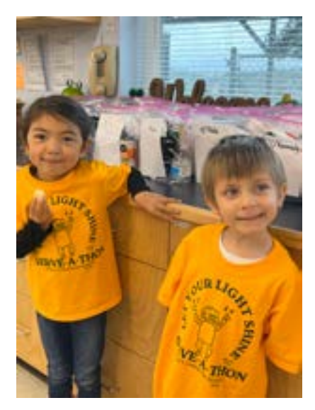
Above: Kindergarten students pack blessing bags for unhoused individuals.