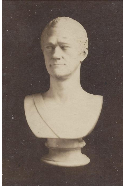
Bust of Alexander Hamilton. Jefferson kept one in his home in Monticello, saying: “Opposed in death as in life.”

Within Washington’s cabinet there is immediate friction over the future direction of the economy, which will have much to say about America’s upcoming influence worldwide.