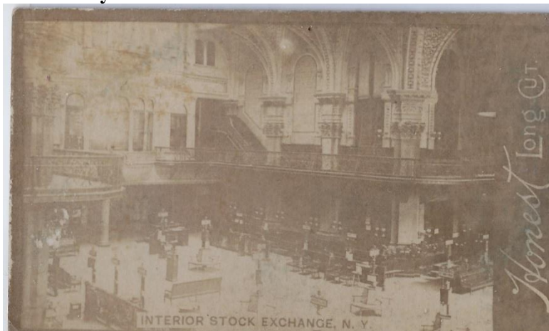
Interior of the New York Stock Exchange, Started Up in May 1792

Hamilton's second source of government funding comes in the form of IOU bonds, similar to those used by the colonialists to finance the war.