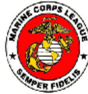
PHOTO RELEASE FORM

I hereby assign and grant to the Marine Corps League and the Scouts of America the right and permission to use and publish the photographs made of me this date by the Marine Corps League and/or the Scouts of America, and I hereby release the Marine Corps League and the Scouts of America from any and all liability from such use and publication, whether online or in print.