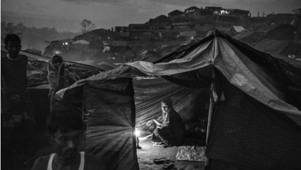
The need for aid is overwhelming. With the monsoon season approaching, work has begun to re-locate some refugees from the camps most at risk of flooding or landslides and in other sites, work has been taking place to improve drainage channels and strengthen shelters.

The Rohingya (Berma) refugees who fled Myanmar during a brutal military crackdown now face a new danger: rain.