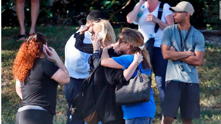
Anxious family members await news of their loved ones