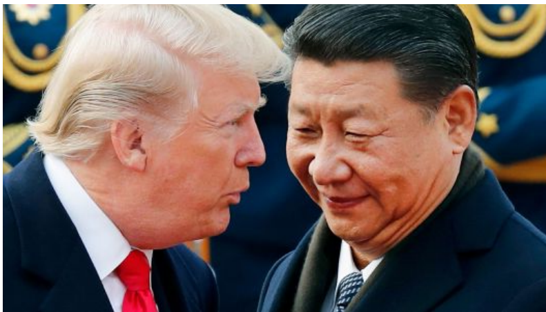
Donald Trump – President of the America (US) Xi Jinping – President of China