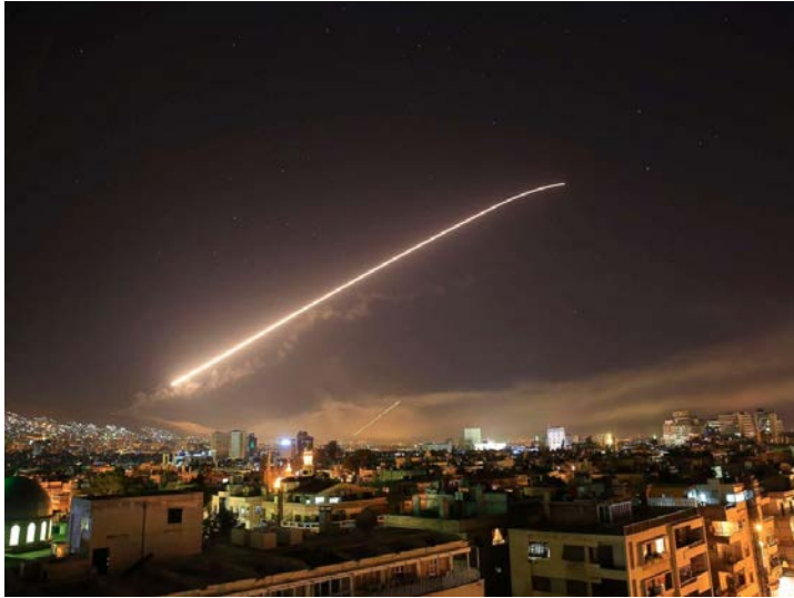
April 14, 2018

The United States, France and Britain together launched military strikes in Syria to punish President Bashar Assad for a suspected chemical attack against civilians and to deter him from doing it again, President Donald Trump announced Friday. Explosions lit up the skies over Damascus, the Syrian capital, as Trump announced the airstrikes from the White House. Syrian television reported that Syrian air defenses have responded to the attack.