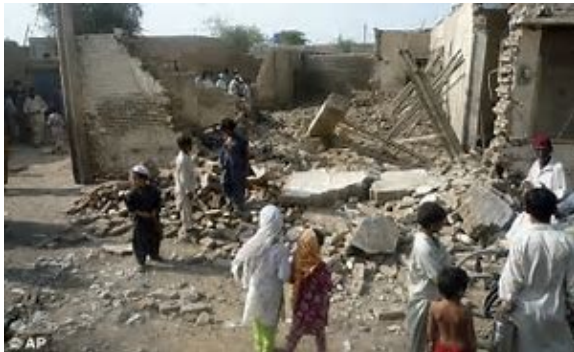
Afghanistan destroyed house in community