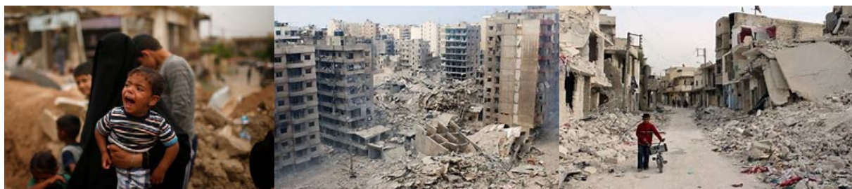
A boy cries as displaced Iraqis flee their homes in Mosul, Iraq in May 2017

Iraq, US, Iraq 2003 invasion, chemical weapons, war, US occupation of Iraq Wednesday 4 April 2018 21:46 UTC/Wednesday 11 April 2018 15:09 UTC