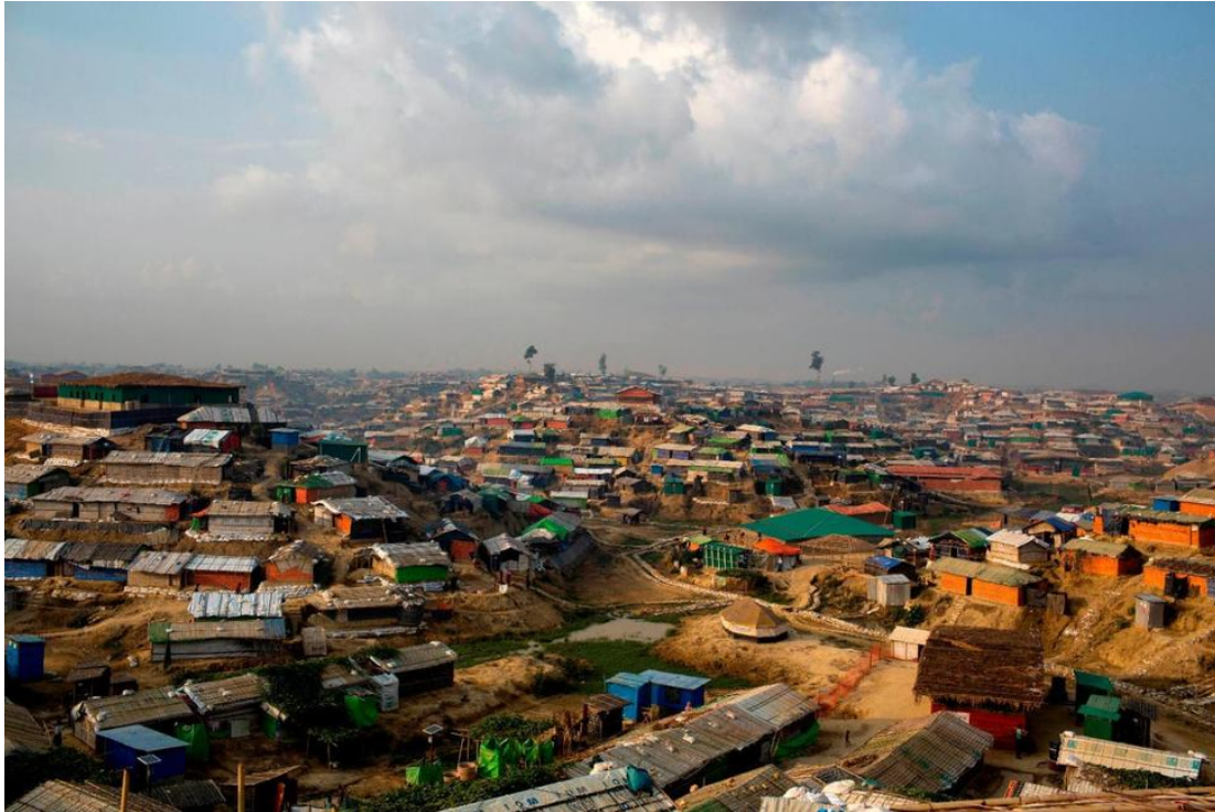
This April 30, 2018, photo shows a view of the Kutupalong Rohingya refugee camp in Kutupalong, Bangladesh. The Rohingya refugees who fled Myanmar amid a brutal military crackdown now face a new danger: Rain. The annual monsoons will soon sweep through camps where some 700,000 Rohingya Muslims live in huts made of bamboo and plastic built along steep hills. (AP Photo/A.M. Ahad) THE ASSOCIATED PRESS BY JULHAS ALAM, Associated Press