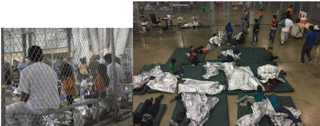
Children taken at the US/Mexico border in detention centers

Children would be separated from their parents if the families had been apprehended entering the country illegally, John F. Kelly, then the homeland security secretary, said in March 2017, “in order to deter more movement along this terribly dangerous network.”