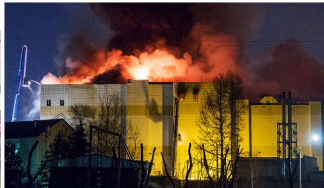
A blazing fire broke out in a shopping centre in Russia, leaving at least 56 dead with many more still missing.

MOSCOW — With anger, sadness, and confusion, Russians struggled to come to grips Monday with a shocking failure of fire safety that allowed a blaze to storm through a crowded shopping center in the Siberian city of Kemerovo, killing 64 people on March 26, 2018. An entire class of schoolchildren apparently died in Sunday’s fire, some having had the chance to make desperate, futile phone calls to parents or relatives before succumbing to the smoke and flames.