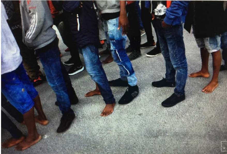
Migrants, part of a group intercepted aboard dinghies off the coast in the Mediterranean Sea, stand in a queue after arriving on a rescue boat at the port of Motril, southern Spain, June 25, 2018.