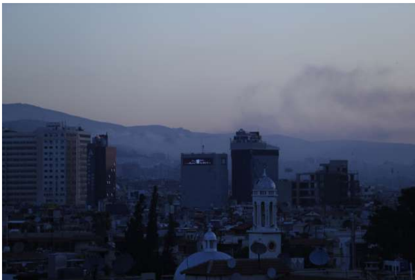
Smoke rises after airstrikes targeting different parts of the Syrian capital Damascus, Syria, early Saturday, April 14, 2018.

DAMASCUS: The United States, Britain and France carried out a wave of strikes against Bashar al-Assad’s Syrian regime on Saturday in response to alleged chemical weapons attacks that President Donald Trump branded the “crimes of a monster.”