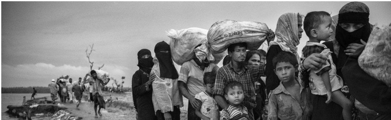
The plight of hundreds of thousands of Rohingya people is said to be the world's fastest growing refugee crisis.