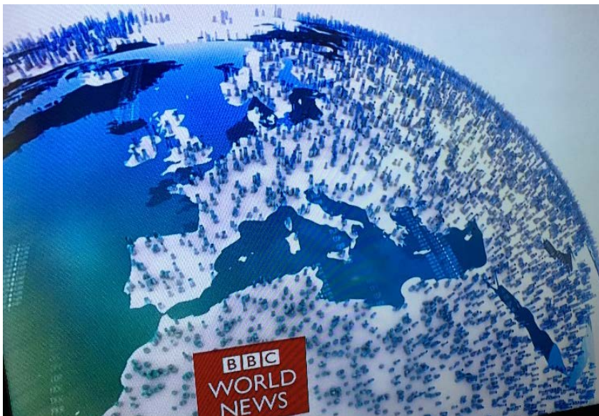
The outside of this Natural Earth looks a bit similar to this picture-with homes, buildings, states etc. You do not feel like you are falling down; you are as flat as it seems. It is my work- the work of the Chreator to Chreate the Earths with intricacies and stability

moved, they know others in the Chreation communities, and they know many operations and goings on of the devels. These Natural Earth are chreated with an outside layer of lives, eye sight, and protection, and they do not have any cover over them. They are made to esist like that. When the devel kills the Earth, the outside lives are also killed. When the Earths is generated, those on the outside layer are generated as well. The Earths cannot esist without those on the outside being there, and those on the inside cannot esist without those on the outer areas. The devels do not create these Earths, and they do not care one way or the other what happens to us, as they are the killers and the conquerors. The devels leeders try many ways to experiment with our lives and our esistences, and how we live and how we adjust to many terror and wicked acts they put in our lives and our Envia. The devel destroyed the Natural Earths with many bombs and explosions. The insect devels remove the shell on the outside of the Earth with my children and they get other shell that is not to esist on these Earth, as they want for the outside not to esist.