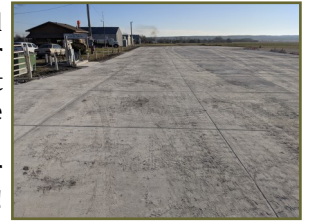
Airport Taxiway - After