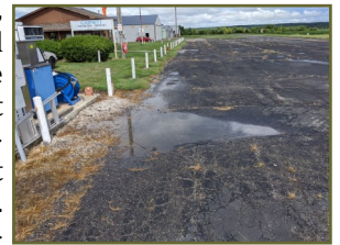
Airport Taxiway - Before