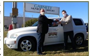
AuBurn Pharmacy donates courtesy car