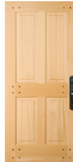
77144 RP Shown in nootka cypress