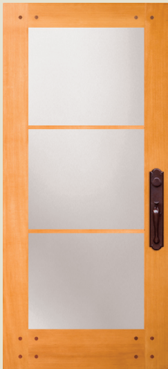
77103 Shown in Douglas fir with optional shaker sticking

TEST DRIVE YOUR DOOR simpsondoor.com/testdrive