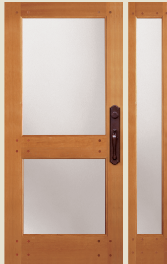
77082 Shown in Douglas fir with 77701 sidelight