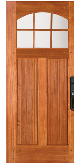
77660 FP Shown in sapele mahogany with optional shaker sticking