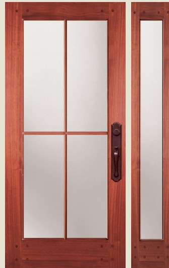
77122 Shown in sapele mahogany with 77701 sidelight