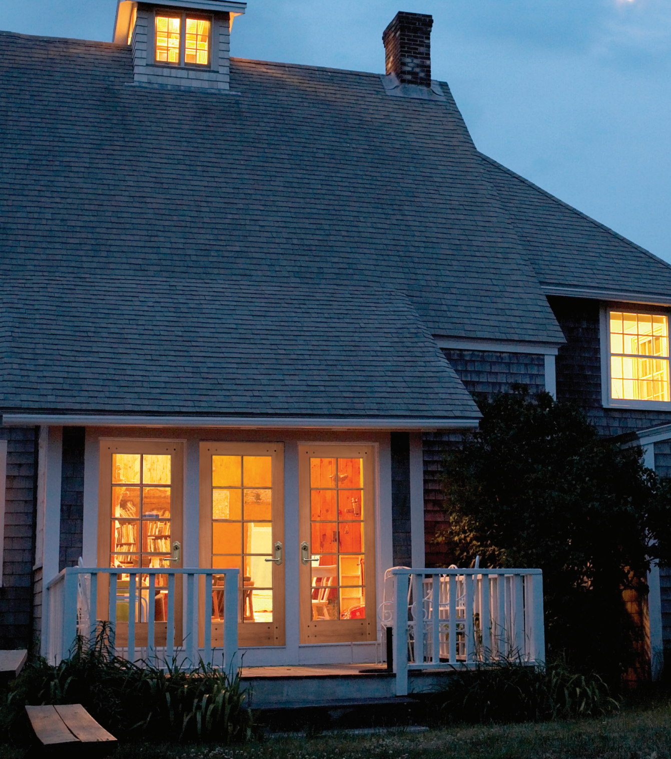
77010 Shown in Douglas fir