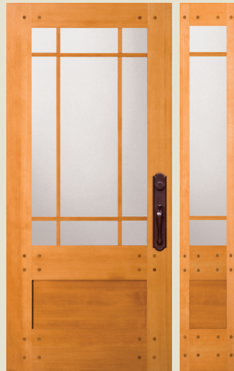
77598 FP Shown in Douglas fir with 77599 sidelight and optional shaker sticking

DOOR OPTIONS INCLUDE (SEE SIMPSONDOOR.COM/OPTIONS ):