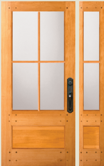
77504 FP Shown in Douglas fir with 77802 sidelight