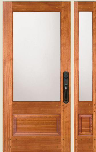
77501 RP Shown in sapele mahogany with 77801 sidelight