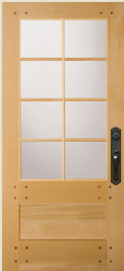
77508 FP Shown in nootka cypress