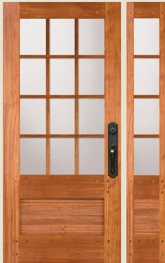
77512 FP Shown in sapele mahogany with 77804 sidelight and optional shaker sticking