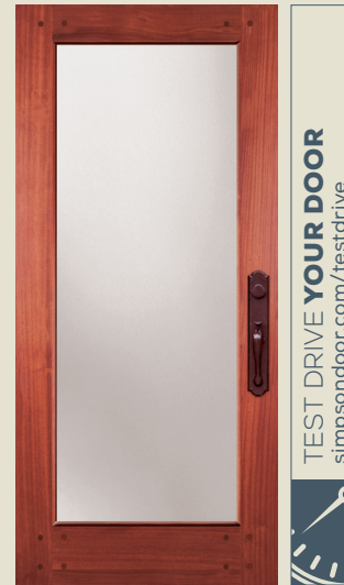
77002 Shown in sapele mahogany

TEST DRIVE YOUR DOOR simpsondoor.com/testdrive