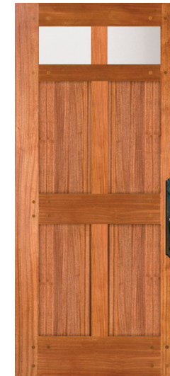
77132 FP Shown in sapele mahogany with optional shaker sticking