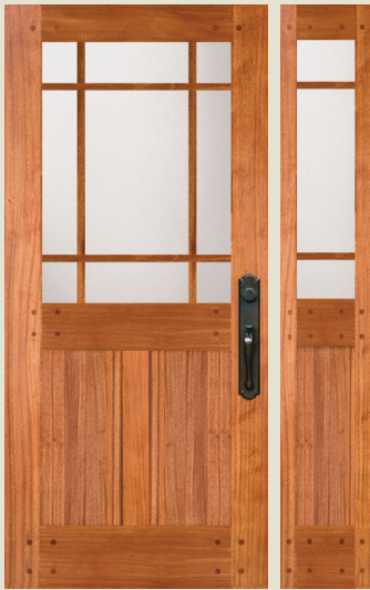
77943 FP Shown in sapele mahogany with 77843 sidelight and optional shaker sticking