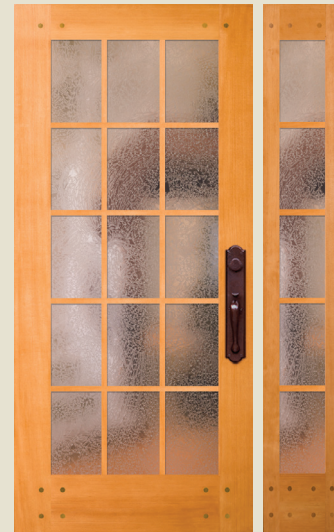
77015 Shown in Douglas fir with 77705 sidelight and optional shaker sticking and glue chip glass. Privacy Rating 6.

ANY DOOR. ANY GLASS. Shown with optional Glue Chip Glass