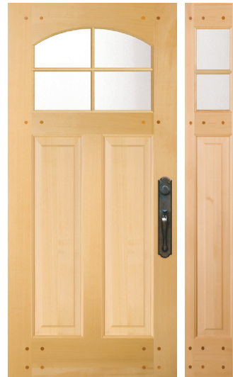
77684 RP Shown in nootka cypress with 77663 sidelight