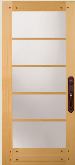
77105 Shown in nootka cypress with optional shaker sticking