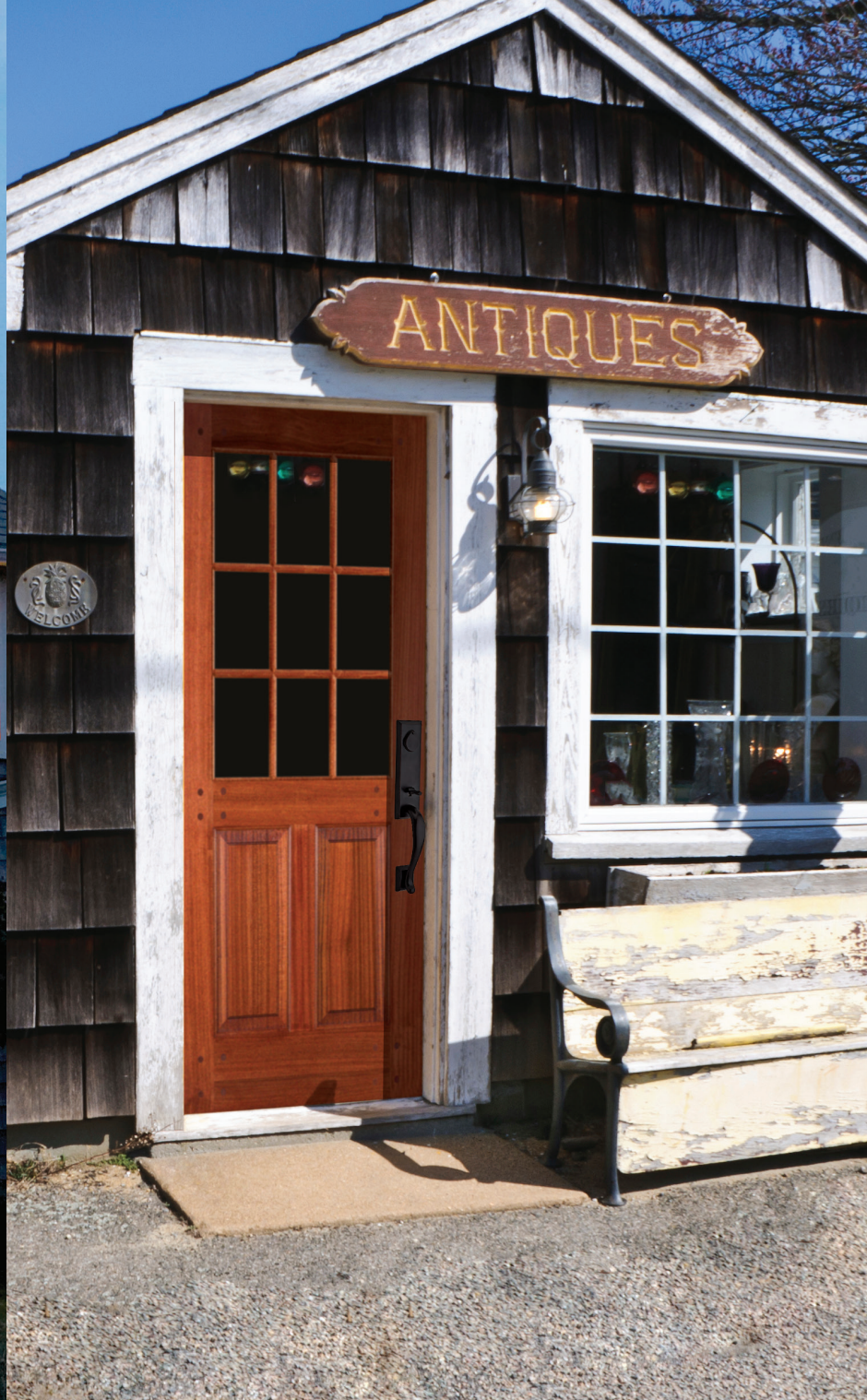
77944 Shown in sapele mahogany with raised panels