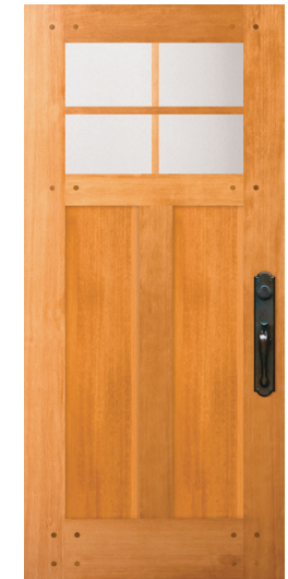
77664 FP Shown in Douglas fir with optional shaker sticking