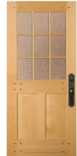
77944 FP Shown in nootka cypress with 77703 sidelight and optional P-516 glass. Privacy Rating 5.