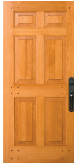
77130 RP Shown in Douglas fir