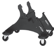
CA-20 A : 23" C : 20"