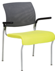
OC-4 A : 19 1/2" C : 18" E : 14"