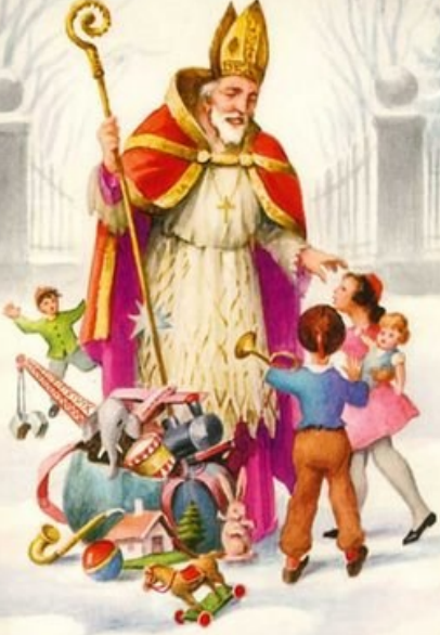
Saint Nicholas of Bari / Santa Claus