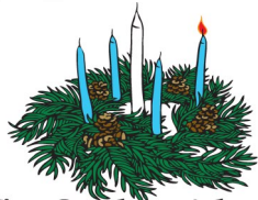
First Sunday of Advent