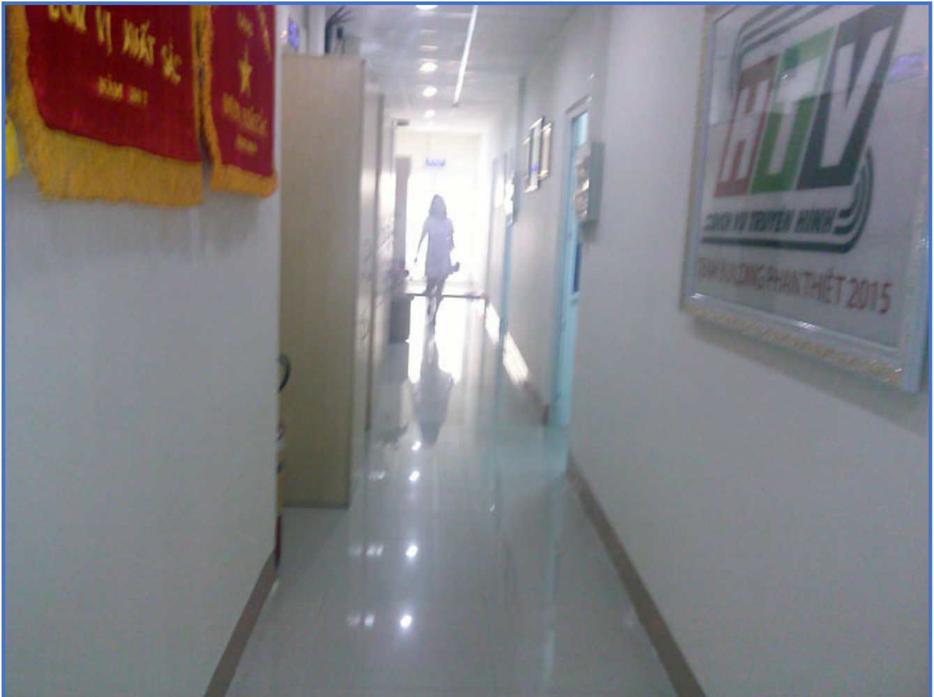
An employee coming in from the back of the building.