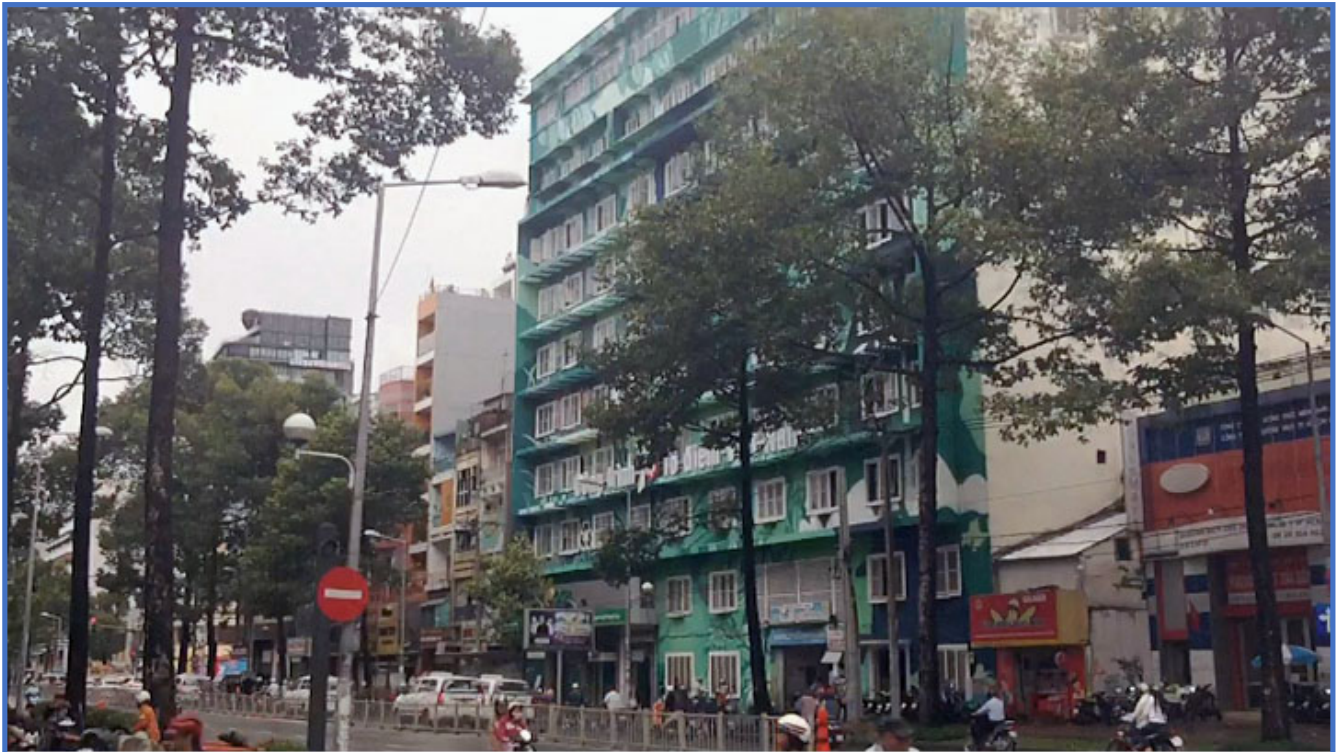
The Plaza Hotel (BEQ).