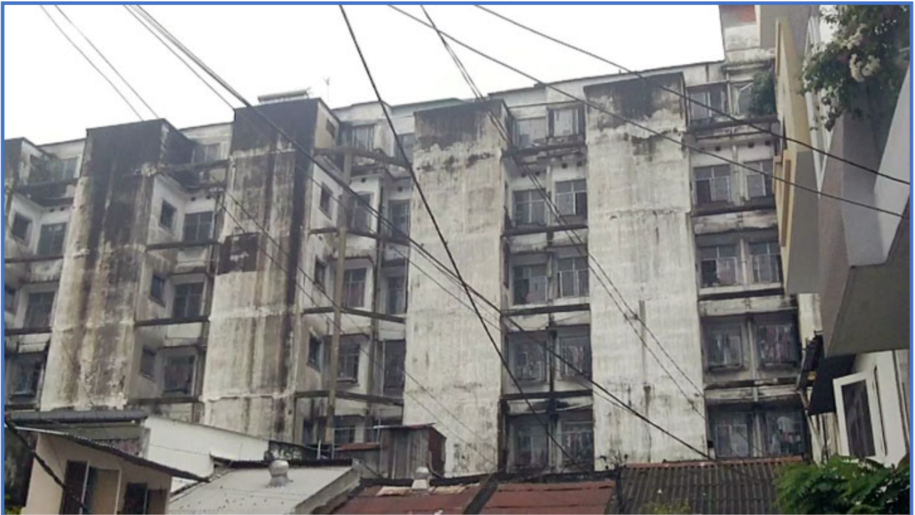
The Plaza Hotel from the alley.