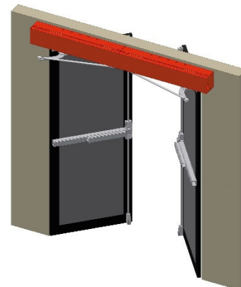
OUT/PUSH (doors swing away from Operators)