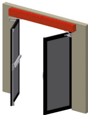
IN/PULL (doors swing under Operators)