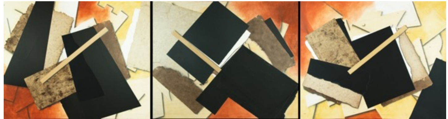
FORMS AND COLORS 3, 2018, watercolor and collage on wood, 63.78 x 153.54 in. 162 x 390 cm.

Opening Reception: Tuesday, October 9<sup>th</sup> from 6 – 8 p.m.