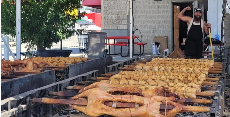
Chicken and Spanferkel!