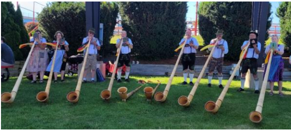
The Alpine Horns!