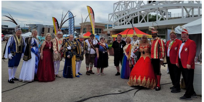
Getting ready to line up for the parade!