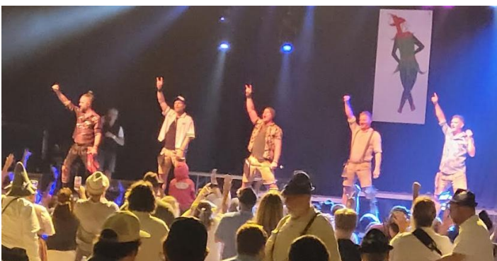
VoXXclub – Sharp, strong performance....