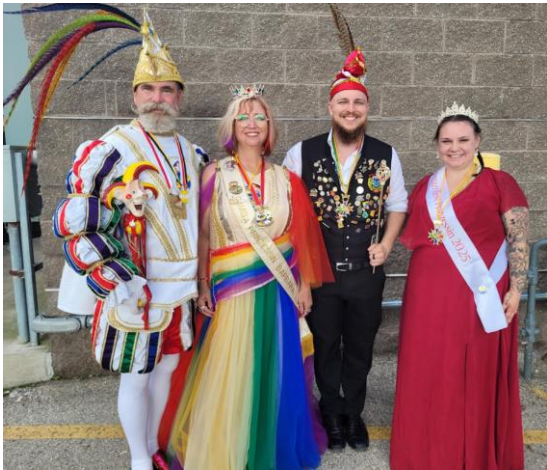
The GAMGA and the very newest Prinzenpaaren!