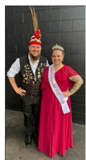
German Fest's 1 st Prinzenpaar!