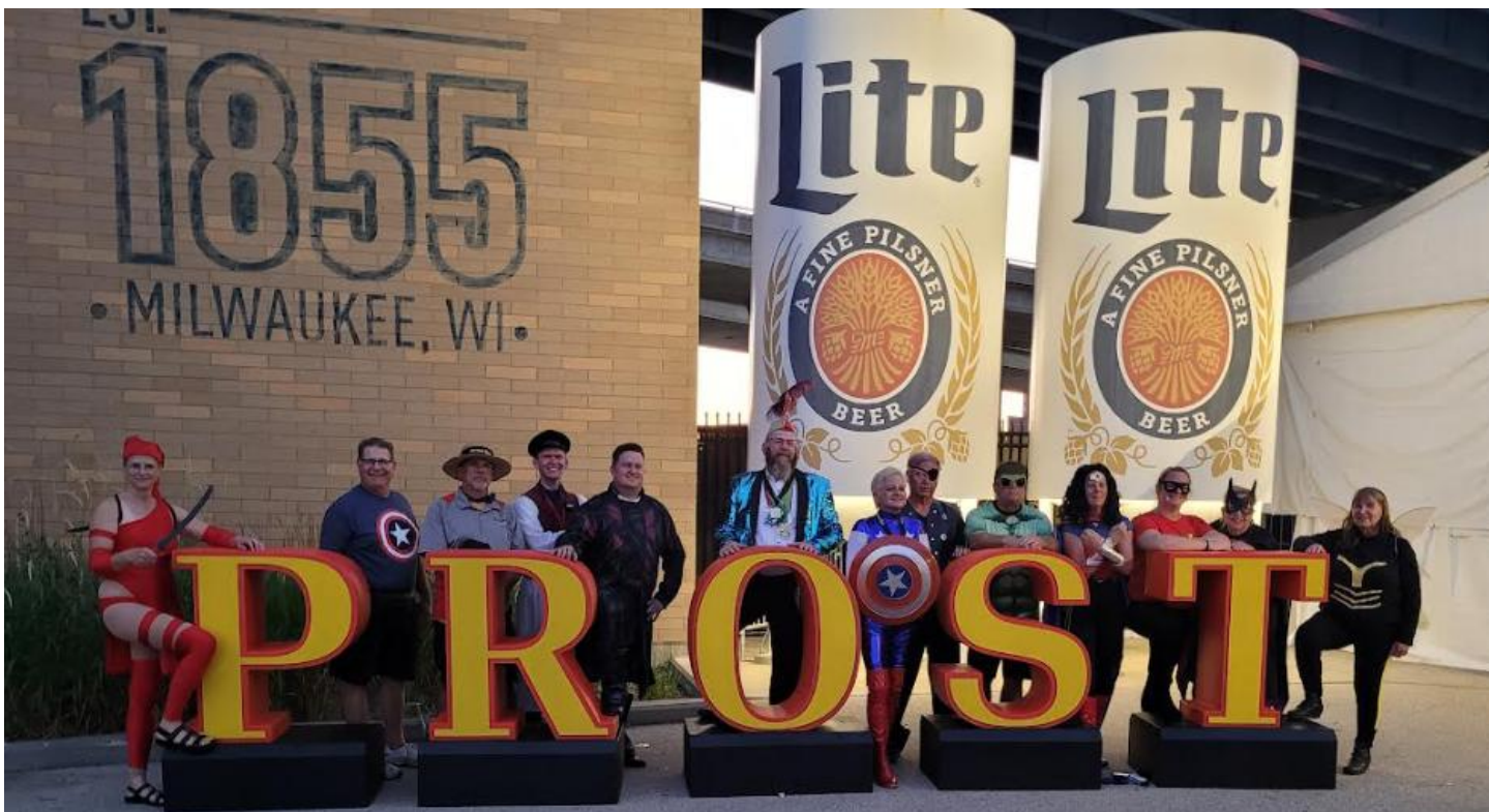
Even the German Fest Directors got into the Karneval Spirit...and of course, they are ALL Super Heers! ❤️