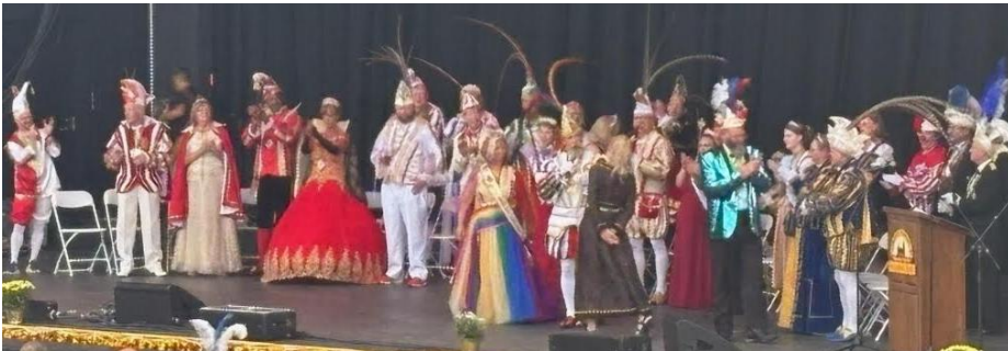
Mardi Gras Show is over – now all over the Miller Stage for a MASKENBALL!