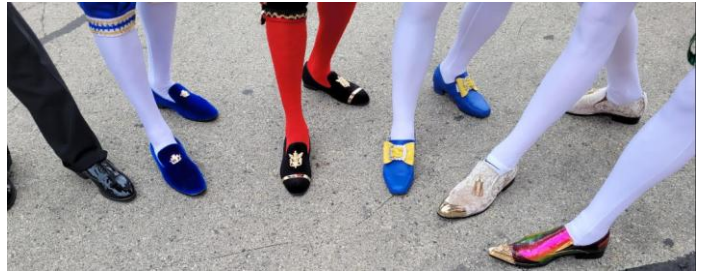
Some of our Prinzessins.....and their Prinz's.....But these SHOES!!!!