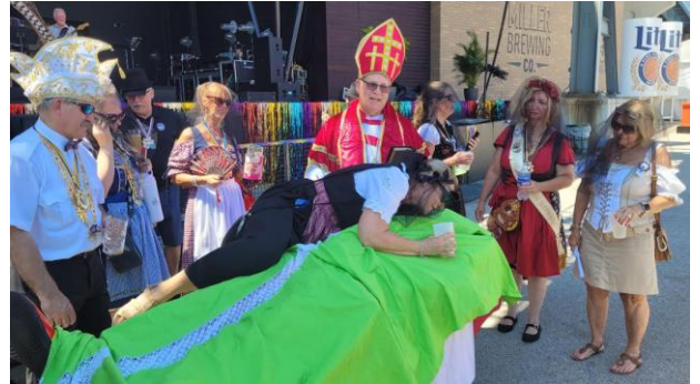
Kehraus processional thru the Fest grounds...and with 'ein Schluck und ein Kuss'.... Now we wait until Nov. 11 !