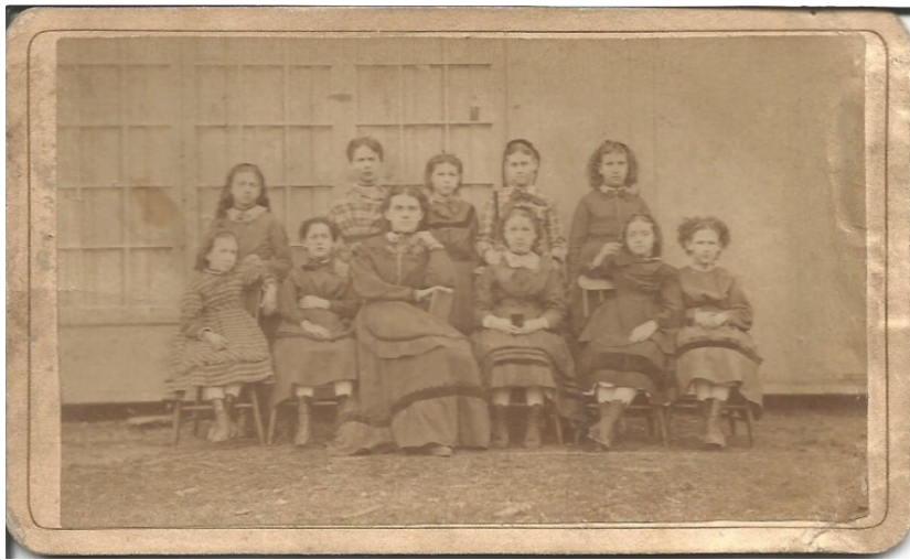
A Typical Teacher And Her Students

Mann's position as Board Secretary represents the first attempt by any state to recognize the importance of education to the nation's future. The legislation which creates his office defines his duty to "investigate the moral and material conditions of the schools and discover the best methods for improving them."