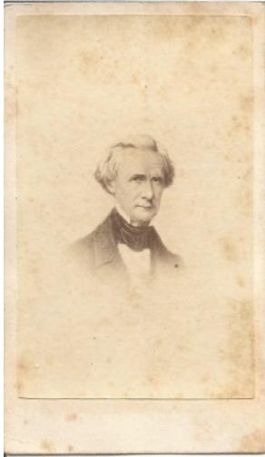
Horace Mann (1796-1859)

While Alcott is experimenting with upscale students, others in Massachusetts hope to establish a system of common (or public) schools that will benefit the masses.