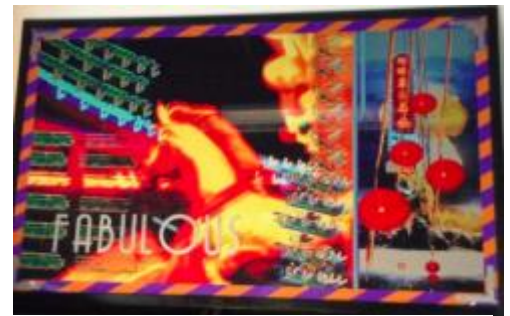
MIXED MEDIA ARTWORK BY LAVINIA BRANCA SNYDER, A NEW YORK CITY SOCIALITE AND CONTEMPORARY ARTIST; THREE-DIMENSIONAL AND LARGE, AT 46 INCHES BY 75 INCHES (EST. $1,000-$3,000).

Barnebys Auctions Online USA Ltd. 33 Irving Place New York, NY 10003 www.barnebys.com