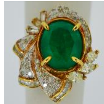
LADIES' BERYL, DIAMOND AND 18KT YELLOW GOLD RING, SIZE 6 1/4, WITH OVAL BERYL DOUBLET SURROUNDED BY 45 DIAMONDS (EST. $550-$1,100).