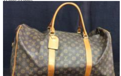
LOUIS VUITTON TRAVEL-SIZE DUFFEL BAG (OR SACHEL) WITH LUGGAGE TAG, CRAFTED WITH THE TRADITIONAL LOUIS VUITTON MONOGRAM, CANVAS WITH DUAL-ROLLED HANDLES (EST. $1,000-$1,500).