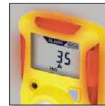
Easy to See