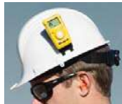
Hard Hat Clip