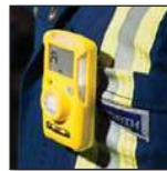
Easy To Wear