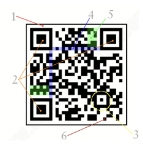
Fig 1: QR Code Architecture <sup>[9]</sup>

The representation of a QR Code can be easily understood by the following image: