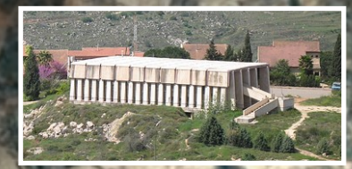
Synagogue at Shiloh - Tabernacle Model

Although it entered in the heart of David to build a permanent 'House' for YHVH in Jerusalem, YHVH forbid it due to David being a man of war. Herein is a fantastic clue of when and how the 3rd Temple is to be built. It has to follow the same protocols, prophetically. In this case, it had and has to be by a 'Man of Peace' to come like that of David's son, Solomon to build the Temple. The mere name of Solomon is a derivative of Shalom or 'peace', etc. Thus, whomever is to come on the scheme in modern Israel that promises 'Peace and Security' will also be that one to build the 3rd Temple.