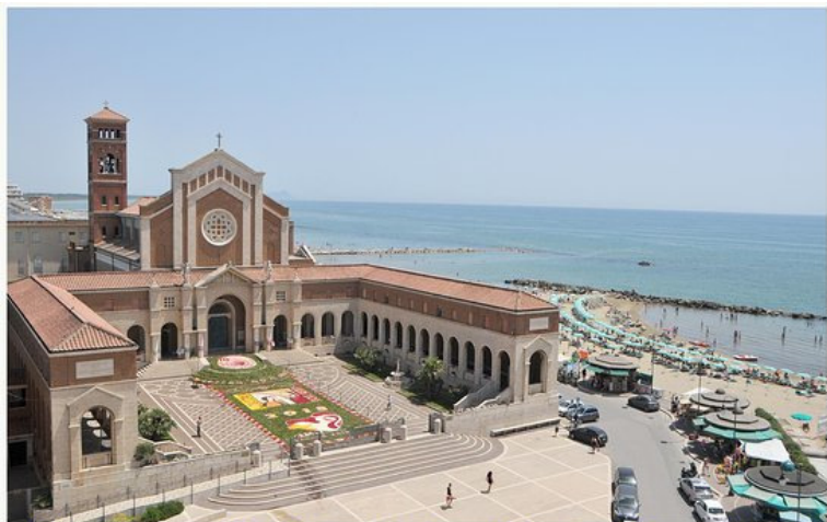
Nettuno 3 Giugno 2018 Santuario in Fiore "Solemnita del Corpus Domini"

Today, once again we will venture outside of Rome to the city of Nettuno along the Tyreman Coast to visit the Shrines of St. Maria Teresa Goretti .