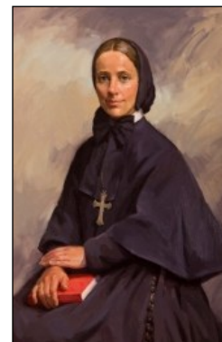
Feast Day November 13