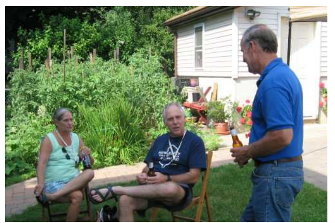
Look at those tomato plants Join CTCI now if you haven't yet. The Early Bird magazine alone is worth the fee