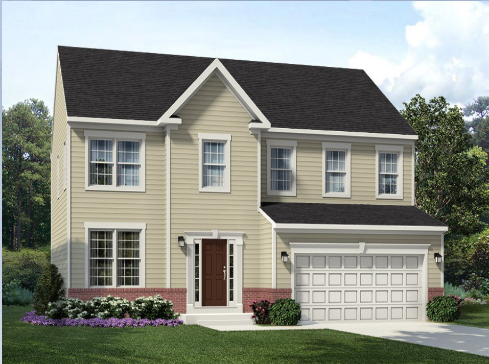
Elevation A (w/ Opt. Brick Watertable)

4-5 Bedrooms, 2.5-3.5 Bathrooms, 2,210-3,360 Square Feet