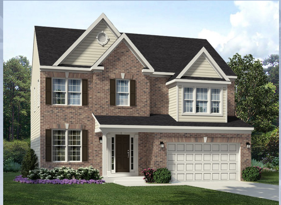
Elevation B (w/ Opt. Brick Front & Opt. Sitting Room)