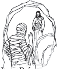
Jesus Raises Lazarus from the Dead