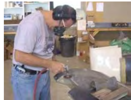
Installing Landing Lights