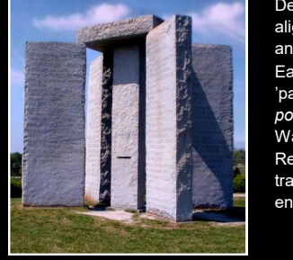
Biblebelievers.org.au Cutting Edge Ministries Macquirelatory.com TimeAndDate.com Wikipedia.com

© Graphics and composition by MAIN SOURCES FOR ILLUSTRATION PURPOSES ONLY