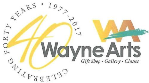
EXHIBIT LABEL INFORMATION

Print two (2) copies. Fill out each completely and legibly. Cut and attach one set of labels to the front of the appropriate pieces. Leave the second page set uncut.