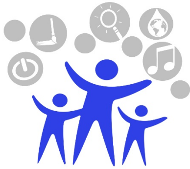
2019 Claysburg's "Summer STEM and the Arts" Sponsored by the Claysburg Education Foundation