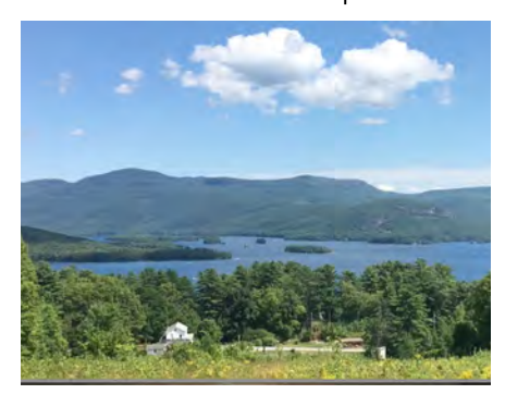
Up Yonda Farm Environmental Education Center

The Lake George Land Conservancy (LGLC) is partnering with Up Yonda Farm Environmental Education Center to offer guided explorations of some of LGLC's favorite preserves.