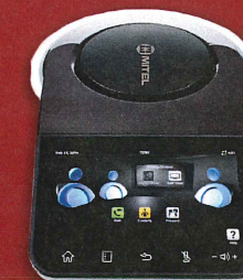
MiCollab Audio Conference Unit

Our support doesn't stop with networking and equipment. We offer various additional devices to serve as your end-to-end one-stop shop.