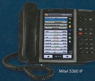
Mitel 5360 IP

Increase productivity, streamline processes, and save money on hardware, maintenance, and IT costs. Plus, Mitel's state-of-the-art solutions integrate easily into your existing IT framework.