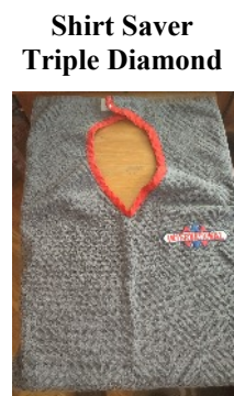
Shirt Saver Triple Diamond