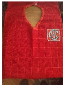
Shirt Saver IHC