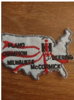
IH Us Patch