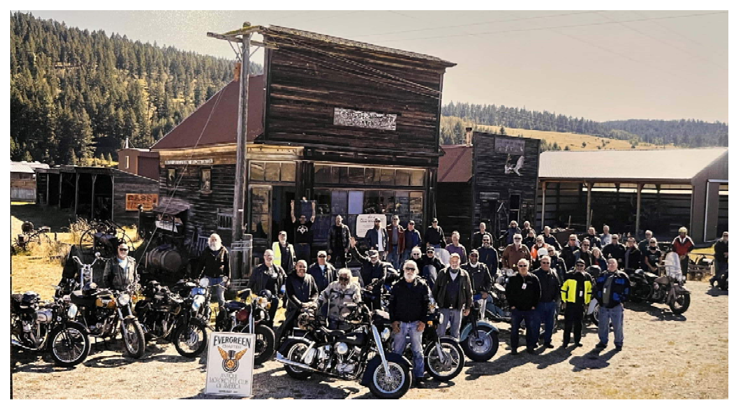
Evergreen National attendees in Molson, WA