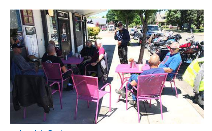
Lunch in Dayton