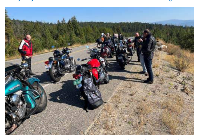
Riders taking a break on the Flowery Trail Road west of Usk