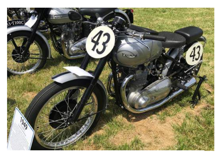
1949 Triumph Grand Prix racer owned by Tom Ruttan