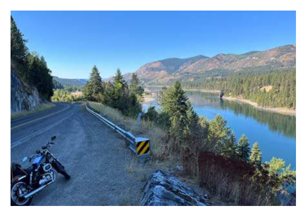
The Columbia River above North Port