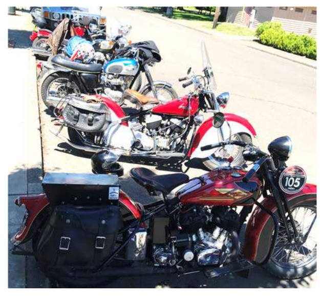
Tim Burn's 1935 HD VLD in line-up outside Don's Antique Tools in Lafayette.