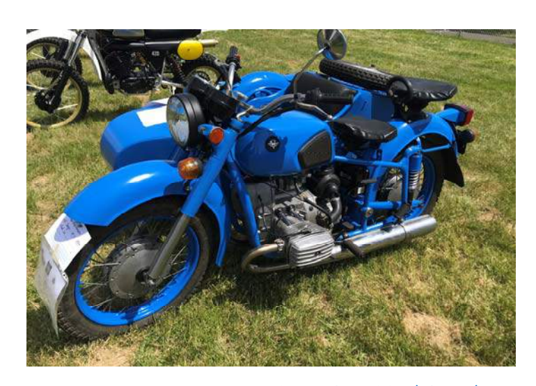
1985 Dnepr 650 cc MT-11. Manufactured in USSR (Ukraine)