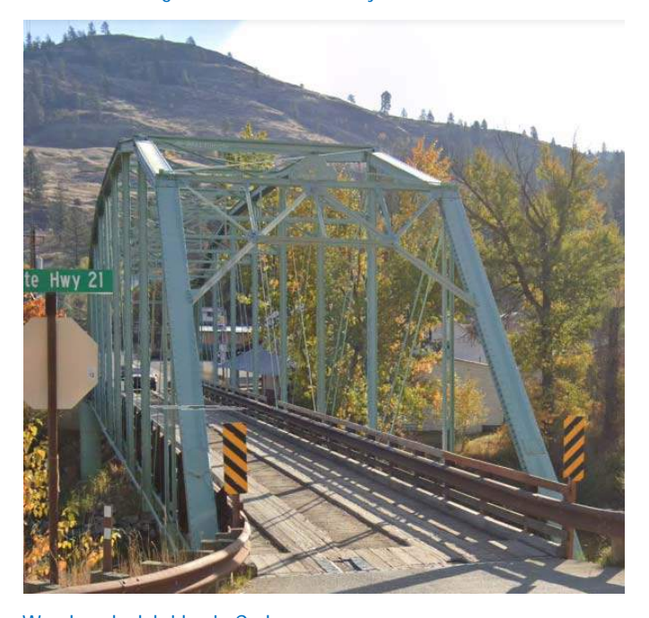
Wooden plank bridge in Curlew