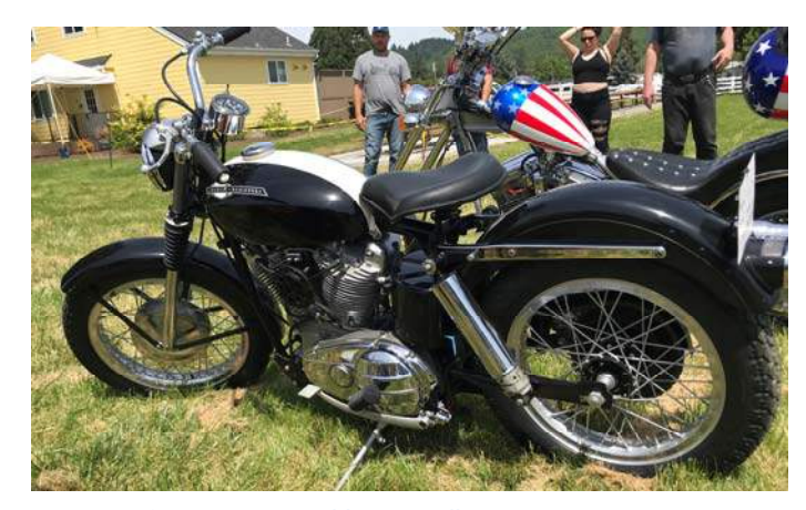
1957 HD Sportster owned by Howell.