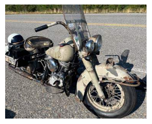
1957 HD FL. Was a South African Police bike. Bike had South Carolina plates and owner from same. He trailered across country, included a stop at Sturgis. Naturally, he won the furthest trailered award.