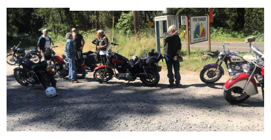
Taking a break near Molalla River. Note "antique" phone booth. It still worked.