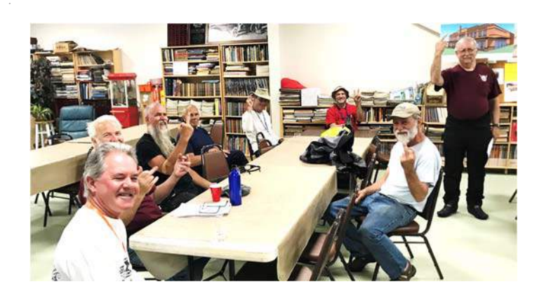
OTC Rally Participants showing their spirit.