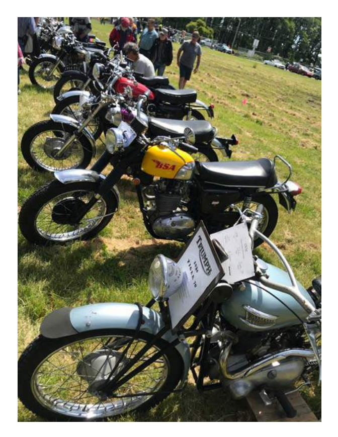
Some of the bikes at the Corvallis show.