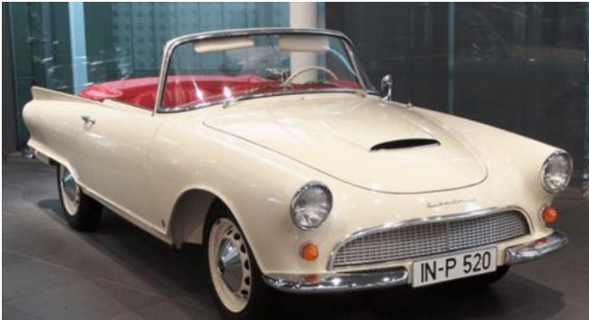
Got a familiar look ? 1965 Auto Union 1000 SP