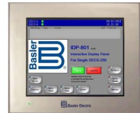
IDP-801 Remote Monitor For Planned Outages

Contact TDS for further discussion, expected lead times, costs and hardware availability to best meets your schedule needs.