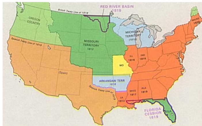
The Proposed State of Missouri (yellow), Bordering Illinois, in 1819