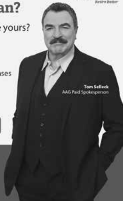
Tom Selleck AAG Paid Spokesperson

NMLS# 9392 ( www.nmlsconsumeraccess.org ). American Advisors Group (AAG) is headquartered at 18200 Von Karman Ave., Suite 300, Irvine, CA 92612. AAG conducts business in TX (Mortgage Banker Registration, 9601 Amberglenn Blvd, Suite 260 Austin, TX 78729). AAG is an equal housing lender. These materials are not from HUD or FHA and were not approved by HUD or a government agency. For full legal disclosure, please visit: www.americanadvisorsgroup.com/disclosure