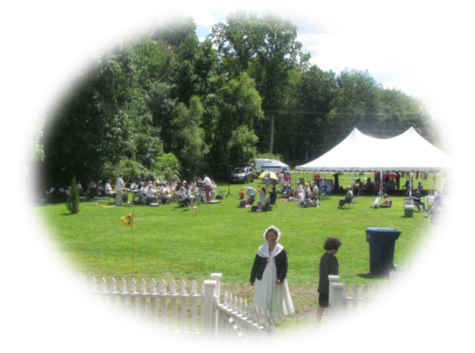
Listening to the Waterford Community Band