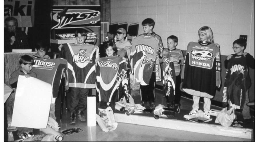
Future enduro stars. Award winners from the Saturday youth classes.

Zahn and Tamara Lewis gave out awards for all the youth riders that participated in last year's youth events on Saturdays. The awards included a jersey from a top off-road star.