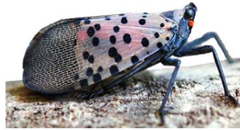
Lateral view of an adult Lycorma delicatula