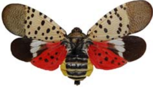
Lycorma adult with wings spread showing colorful hind wing