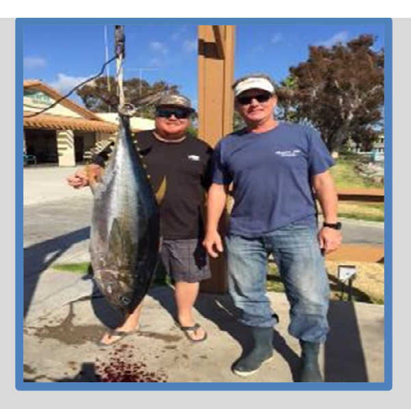
© 2006 Turner's Rod and Reel Club

This email was sent by Turner's Rod and Reel Club, Covina CA 91722.