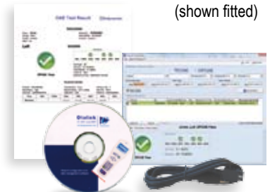
Otolink PC software and download cable