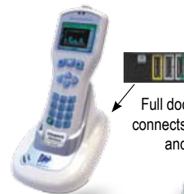
Full docking station, connects to printer, PC and charger