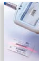
Integral barcode ID reader (optional)