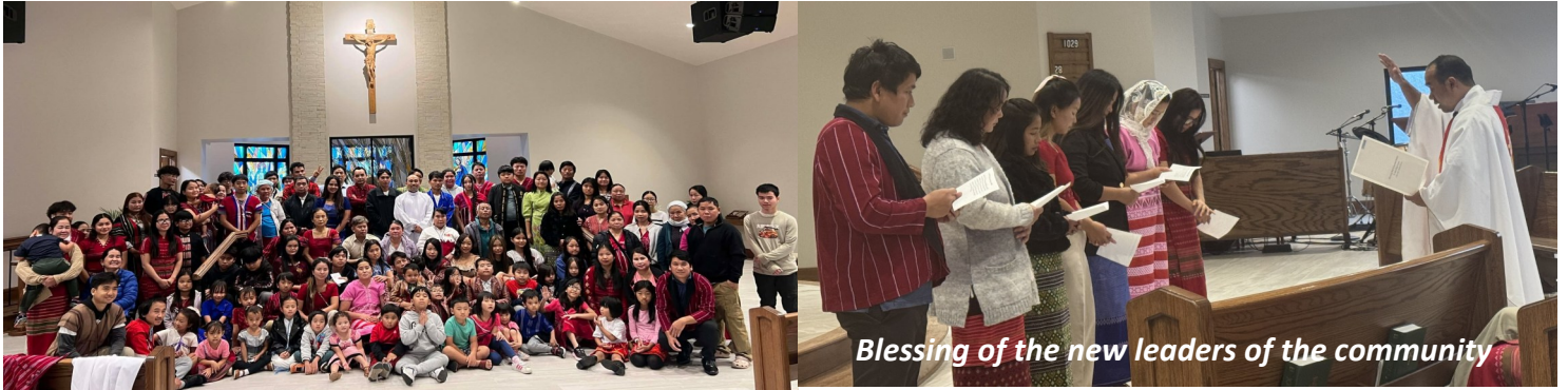
Blessing of the new leaders of the community