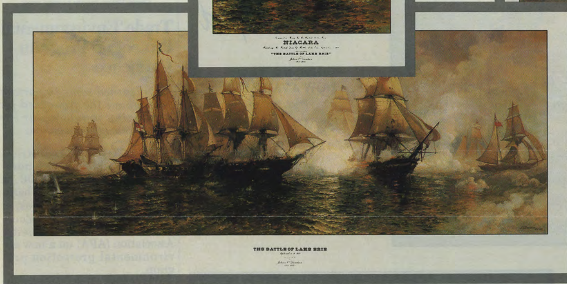
"United States Brig Niagara" 30" x 20" Release Date: 6/20/90 Publication Price: $145.00