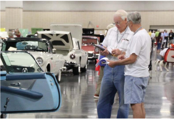
Rich working hard