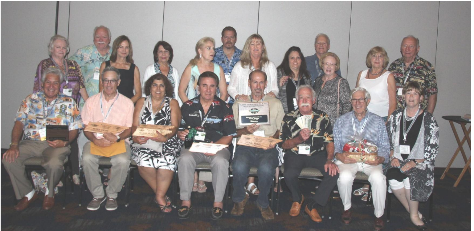
The "Gang" that attended Knoxville