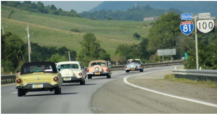
On the road - second group