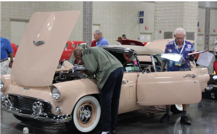
Judge (ment) Day

I want your input. Please send any items to be included by the middle of the month if possible. Email is best, snail mail ok