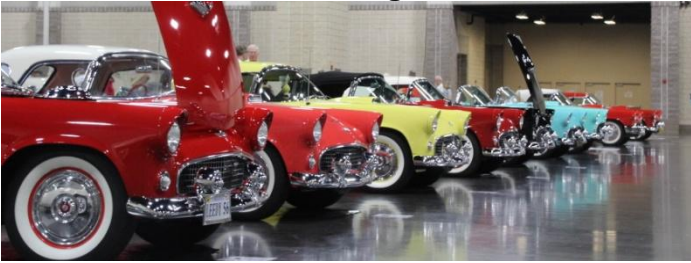
Pretty Birds All In A Row