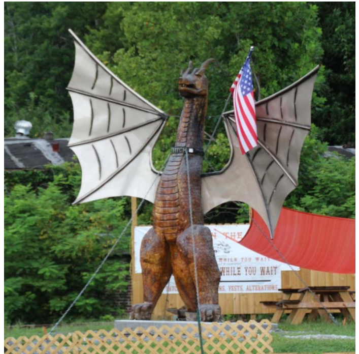
Not sure what/who) this is, but maybe a Tennessee local???