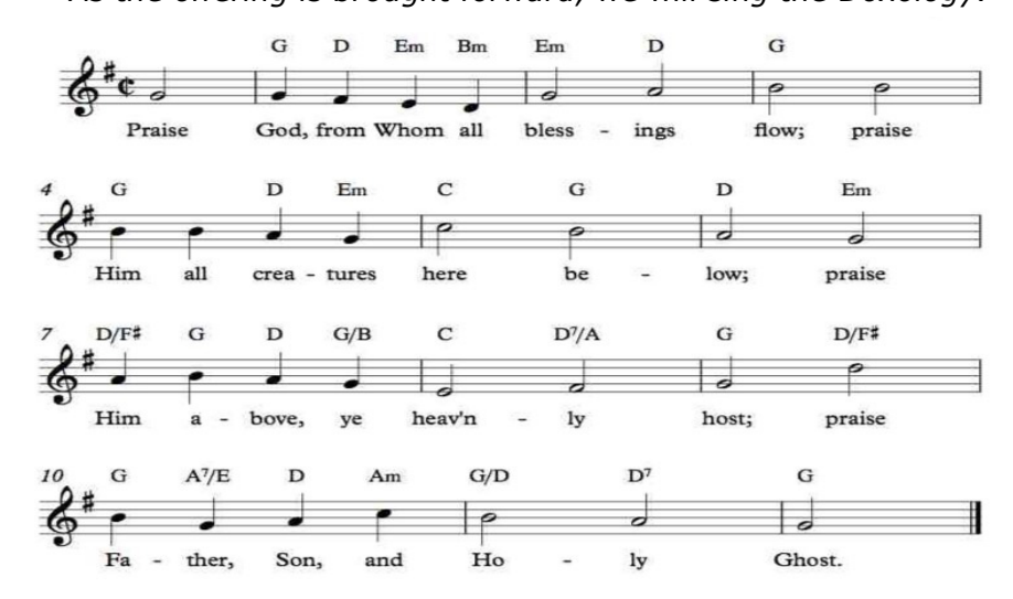
Doxology, written in England for Protestant Churches in 1674.

As the offering is brought forward, we will sing the Doxology.