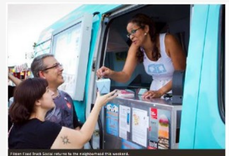
Pilsen Food Truck Social returns to the neighborhood this weekend.

NEAR WEST SIDE — As 90-degree temperatures hit the city this weekend, two festivals — one focused on food, the other, music — will take over the Near West Side this weekend.