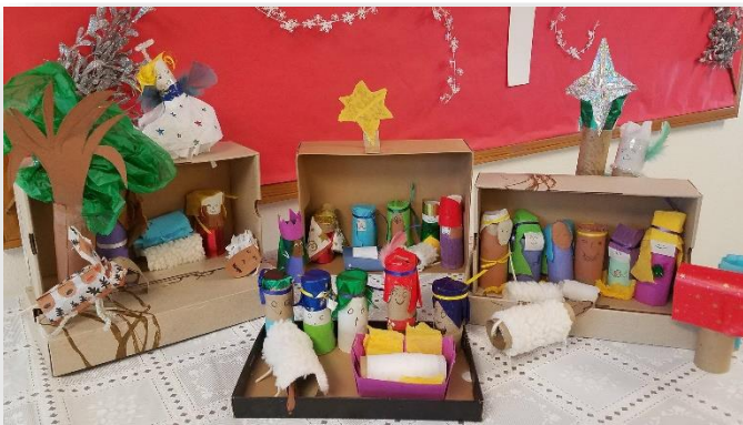
"Nativities" made at Senior Social

We will celebrate Epiphany on January 7th with our annual Festival of the Nativity. Bring your Nativity sets to the fellowship hall for all to enjoy before they get packed up for another year. Bring one, bring two, bring ten! It doesn't have to be a traditional full set; it can be anything depicting the holy family.