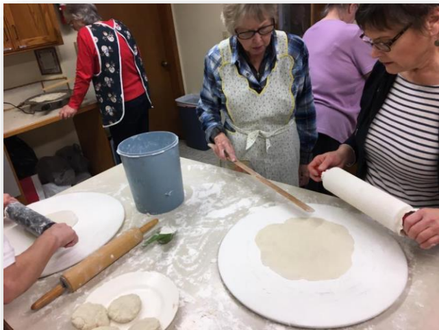
Making Lefsa for the Bazaar

Youth Group: We resume in January on the 2 nd and 4 th Wednesdays, Jan. 10 th and 24 th , at 5:30 PM.