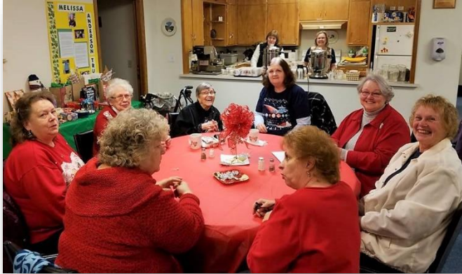
December Senior Social

The January Senior Social lunch will be on Thursday, January 18th at 12:00 noon. What are your "New Year's Resolutions," past and present? All are welcome; see you the 18th.